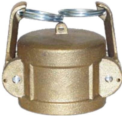
Part DC - Dust Cap