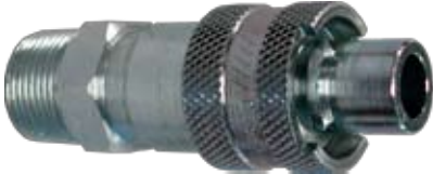
Male Head x Male NPT End