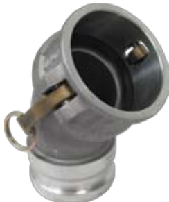
45° Adapter x Coupler