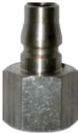
Plug x F NPT