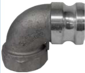
90° Adapter x F NPT