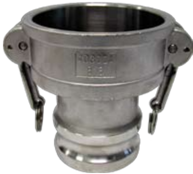
Part CA - Coupler x Adapter