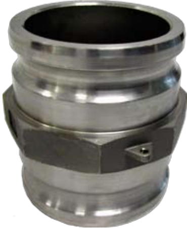
Part SA - Spool Adapter