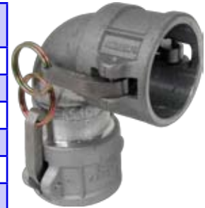
90° Coupler x Coupler