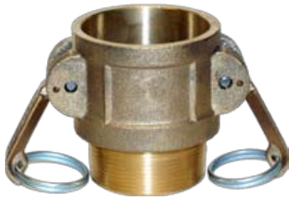
Part B - Coupler x Male NPT