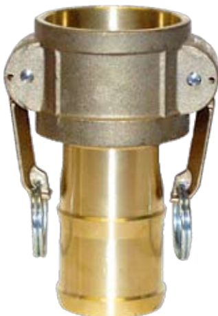
Part C - Coupler x Hose Shank