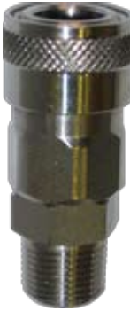
Coupler x M NPT