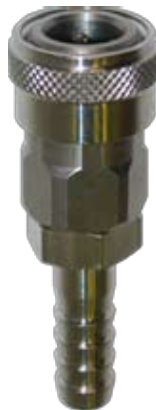
Coupler x Hose barb