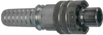
Male Head x Hose End

Industrial quick acting couplings require 5 PSI to get a positive seal and are rated up to 300 PSI. Available in plated steel, brass and stainless steel.