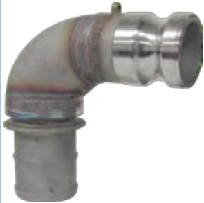
90° Adapter x Hose Shank