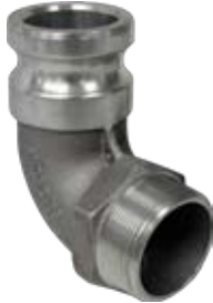
90° Adapter x M NPT