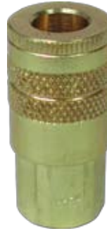
Coupler x F NPT