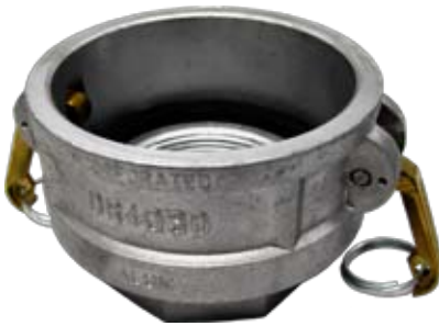
Reducing Part D - Coupler x F NPT