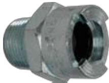
Female Head x Male NPT End