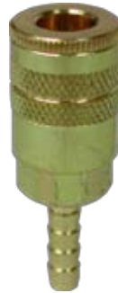
Coupler x Hose Barb