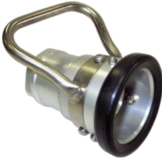
Coupler x Female NPT Dry Disconnect