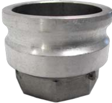
Reducing Part A - Adapter x F NPT