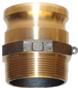
Part F - Adapter x Male NPT