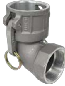
90° Coupler x F NPT