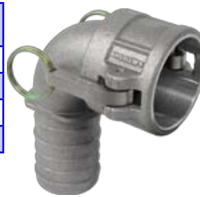
90° Coupler x Hose Shank