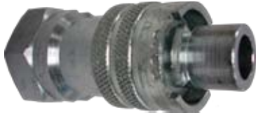
Male Head x Female NPT End