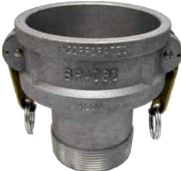
Reducing Part B - Coupler x M NPT