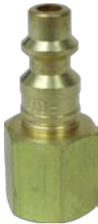
Plug x F NPT