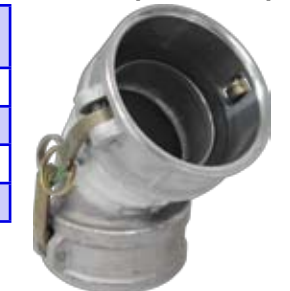
45° Coupler x Coupler