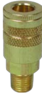
Coupler x M NPT