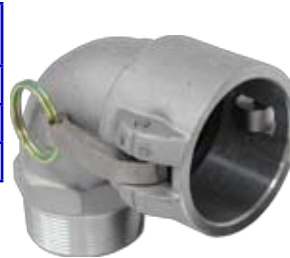
90° Coupler x M NPT