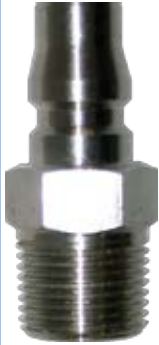
Plug x M NPT