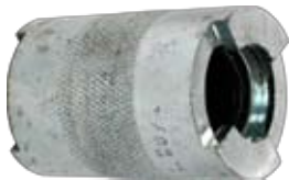
Two Female Heads (Converter)

Available only in steel. Steel Part #: YFB75