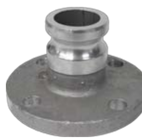
Adapter x 150# Flange