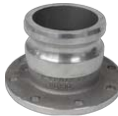
Adapter x TTMA Flange