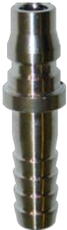
Plug x Hose barb