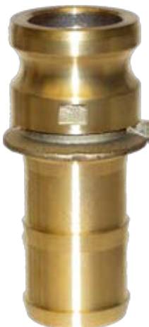
Part E - Adapter x Hose Shank