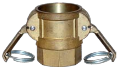
Part D - Coupler x Female NPT