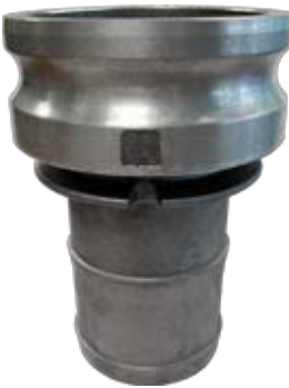
Reducing Part E - Adapter x Shank