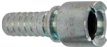
Female Head x Hose End