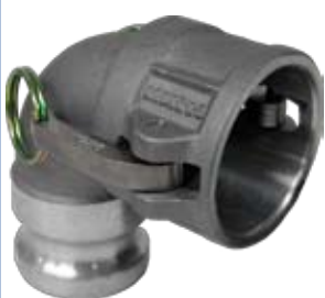
90° Adapter x Coupler