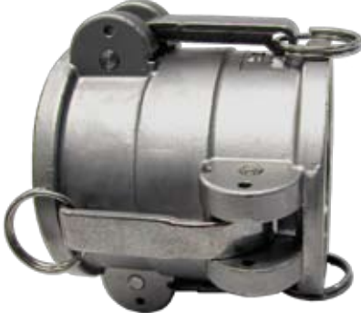
Part CC - Spool Coupler