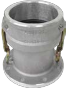
Coupler x TTMA Flange