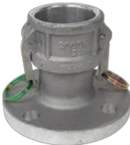
Coupler x 150# Flange