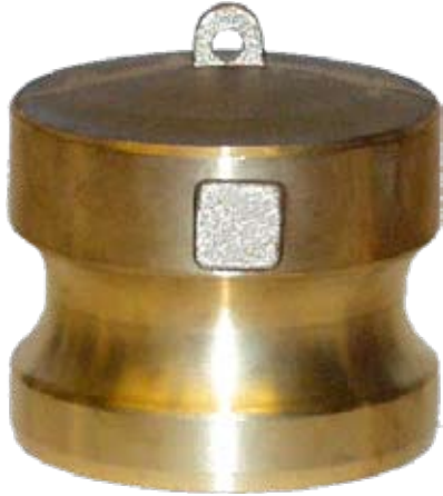
Part DP - Dust Plug