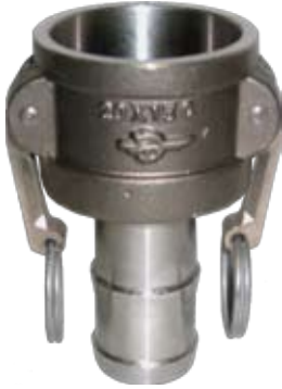
Reducing Part C - Coupler x Shank