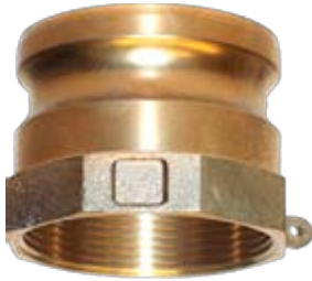
Part A - Adapter x Female NPT

To connect simply slide the adapter into the coupler and with normal hand pressure, press the cam arms down. To uncouple lift the cam arms and remove the adapter. Cam and groove couplers are also available with auto-locking and self-locking handles.