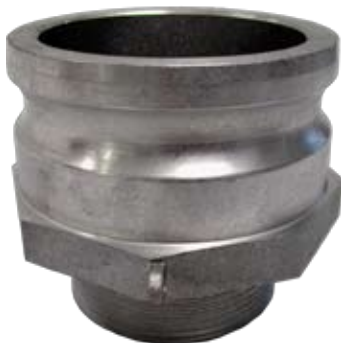
Reducing Part F - Adapter x M NPT