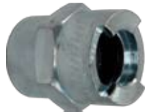
Female Head x Female NPT End