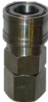
Coupler x F NPT