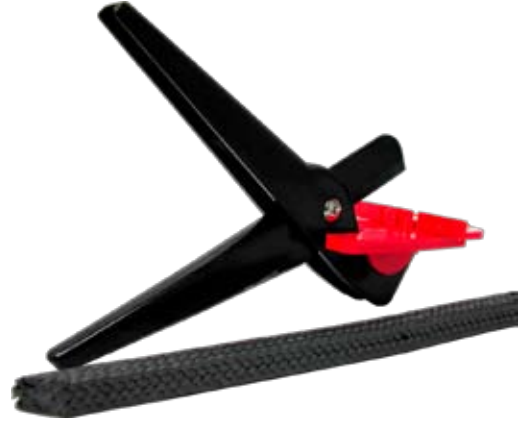
PACKING GASKET CUTTER