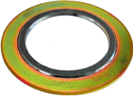
No. SWG - SPIRAL WOUND GASKET