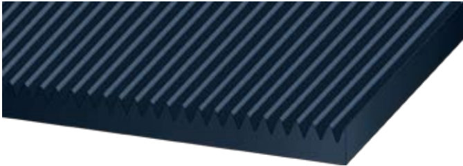
RUBBER SWITCHBOARD MATTING